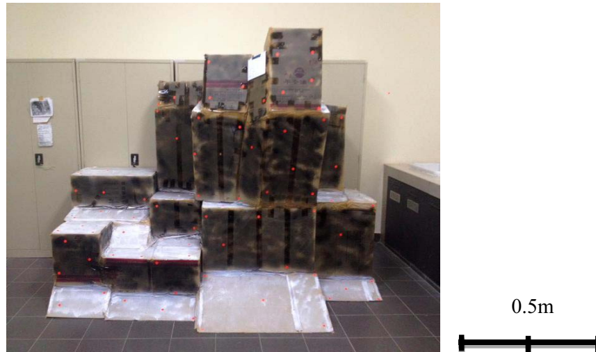
Figure 1: The Rock Mass Model

In order to achieve objective of the study, physical model of a rock mass were develop for this project [Figure 1]. The motivation behind this physical model is to have a joint surface that is not influenced by the weathering such as the joint planes situated at site. Other than that, joint physical model was manufactured to have a deliberate joint system that is difficult to establish at field. The subsequent joint model has a surface rock in even, vertical and slanted to be more like genuine rock incline. 24 points are representing difference surface of each blocks were recorded using the Clar's Compass and iPhone 4s Compass.