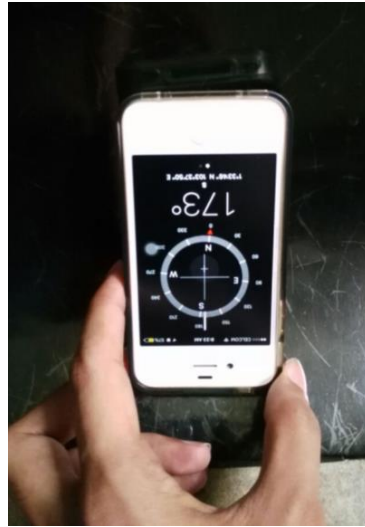
Figure 4: Measure dip direction using iPhone 4s clinometer compass

To support the result obtain for this study, a data from the previous research by [4] Mohamad Safuan (2015), which carried out on the same model was utilised, he used the close range photogrammetry were included in comparing the precision on different devices.