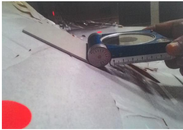
Figure 2: Measure dip angle and dip direction using Clar's Compass

For iPhone 4s clinometer compass, upon running the clinometer compass application iPhone 4s compass will appear notification if detects any interference that usually caused by magnetic field or an electronic device like a cell phone or stereo. To calibrate the iPhone compass, users just need to tilt the screen for the red ball roll around the circle as shown in figure 3. It is advice to tilt the phone after 3 to 4 readings were taken just to avoid magnetic field interruption that can cause errors in data collection. For the clinometer calibration, the device needs to be put on the levelled surface. Tapping onto the screen to calibrate the readings until it shows zero degree.