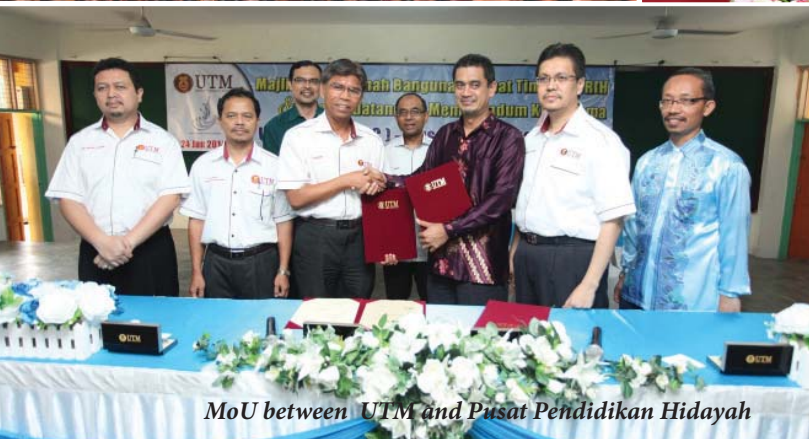
MoU between UTM and Pusat Pendidikan Hidayah