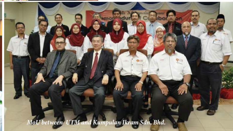
MoU between UTM and Kumpulan Ikram Sdn. Bhd.