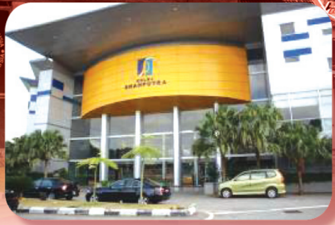
Kolej Shahputra, Kuantan