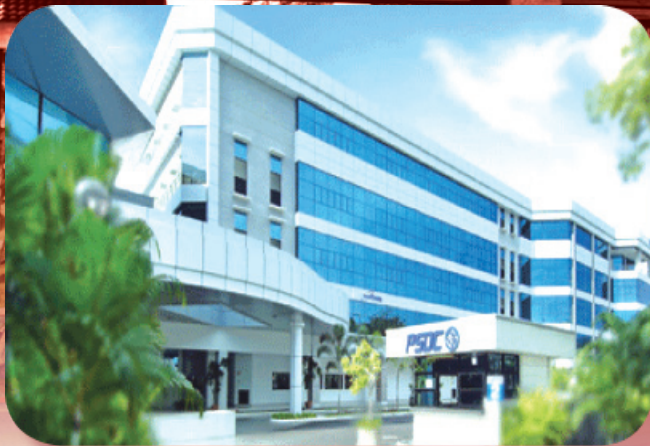
Penang Skills Development Centre (PSDC), Pulau Pinang