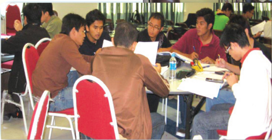
Problem-Based Learning (PBL) rooms provide space for interactive learning and group discussions