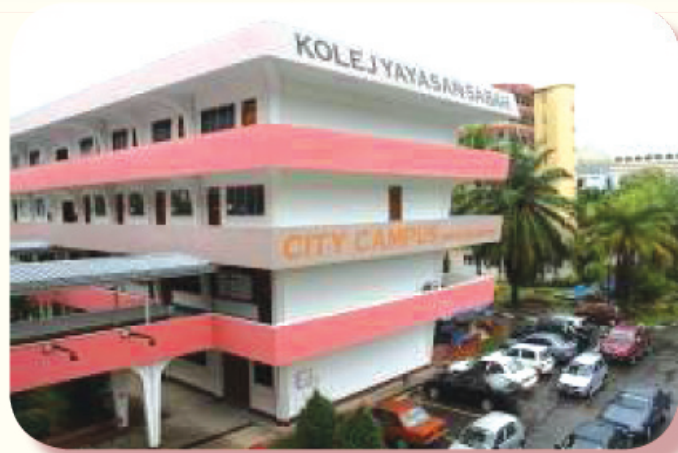
Kolej Yayasan Sabah, Kota Kinabalu