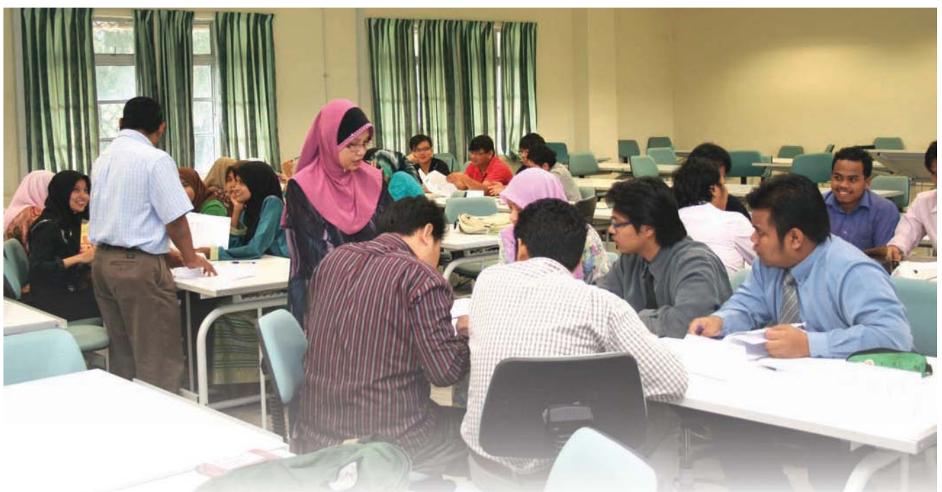
Figure 6.2: Graduate Employability