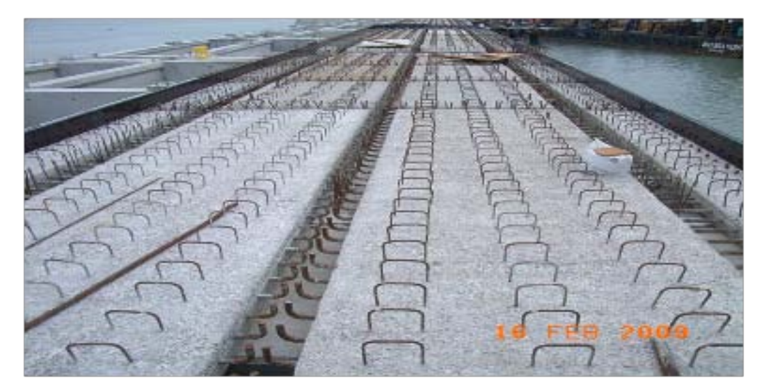
Figure 1.3: Shear Key in Precast Member

The horizontal shear between the two layers can be resisted by the shear capacity of the interface. Using shear key, adhesive material and roughen the interface are different methods to increase shear capacity of the interface and transferring the horizontal shear. Shear key is in the form of a loop which projects across the shear interface. Using of mechanical shear key will significantly improve the bending strength and stiffness. Figure 1.3 shows the position of reinforced shear key in precast members.