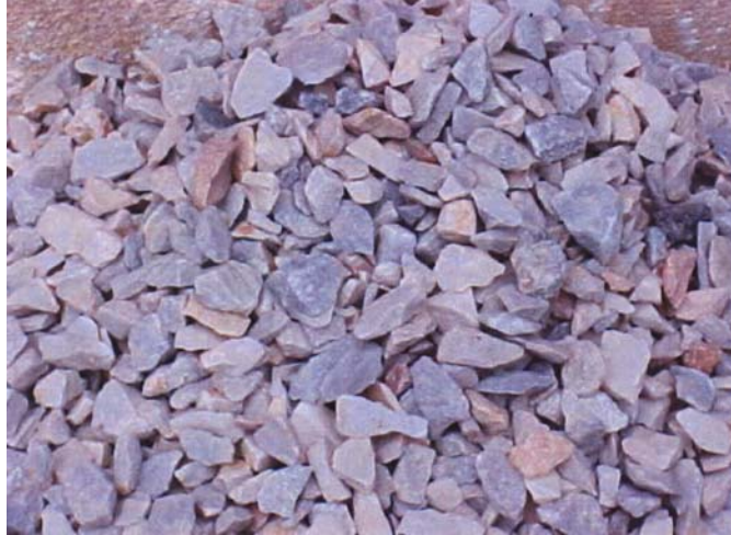
Figure 1.1 : Sample of Limestone Aggregate (Source from Kg. Ulu Gali, Raub, Pahang)