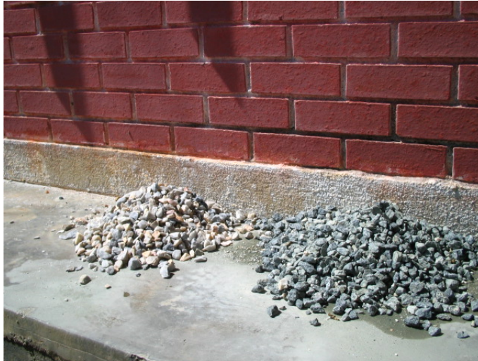
Figure 1.2: Sample of aggregates (left is limestone, right is granite).

The aggregate used in the tests must comply to the standard grading which is through sieve analysis test with 4 kilogram of limestone aggregate sample. The test shall follow a proper procedure and the results are compared to the standard as tabulated in Table 1.2 below:-