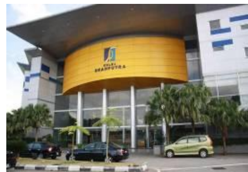
Kolej Shahputra, Kuantan