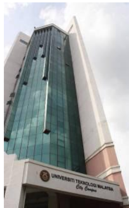
Yayasan Selangor, UTM City Campus, Kuala Lumpur

The number of students undergoing this programme during 2011 is 605.