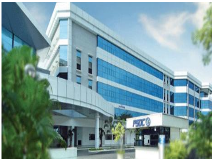
Penang Skills Development Centre (PSDC), Pulau