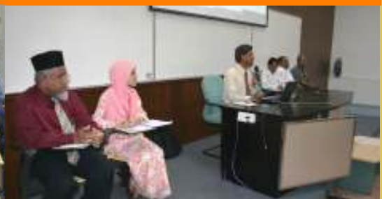
Management visit to UM, UITM, UKM