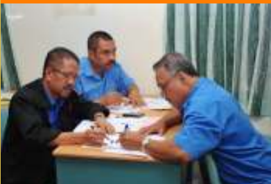
Workshop on communication in English