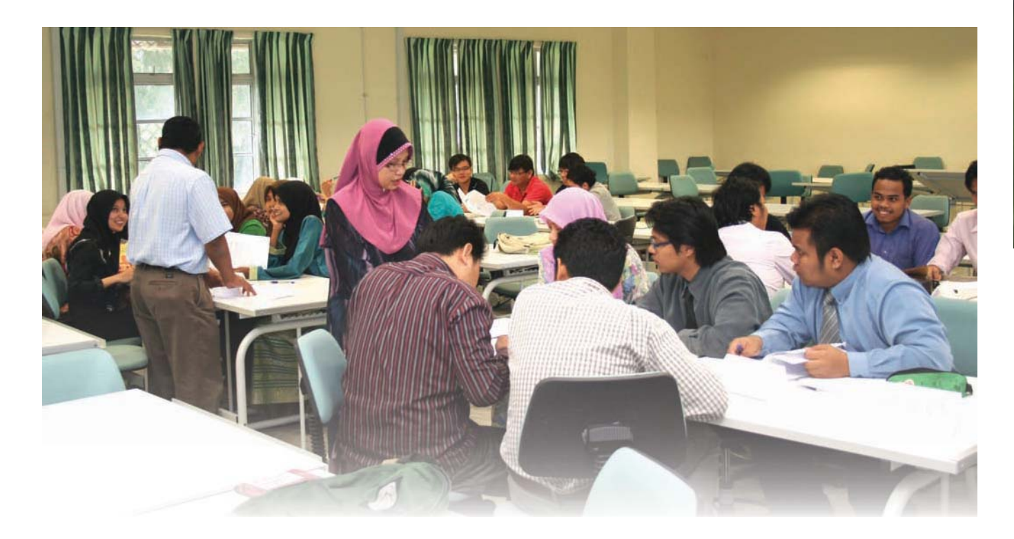
Figure 6.2: Graduate Employability