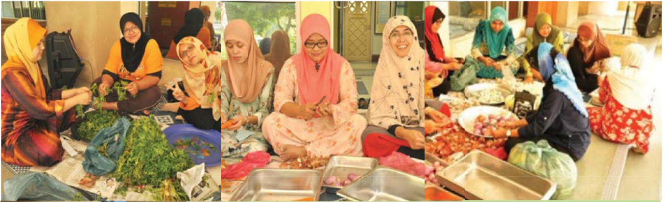
BUBUR LAMBOK PROGRAMME, 8 AUGUST 2012