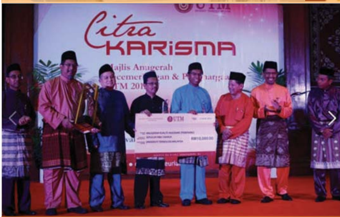
WINNER FOR THE ANUGERAH KUALITI AKADEMIK 2012 AT THE CITRA KARISMA EVENT, 3 JULY 2012