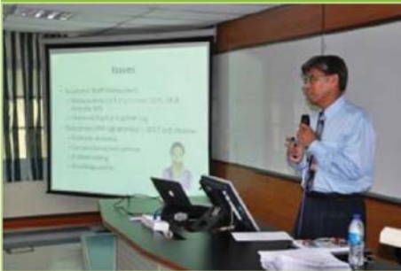
REVIEW OF PEO & PO PRE-WORKSHOP, 26 NOVEMBER 2012