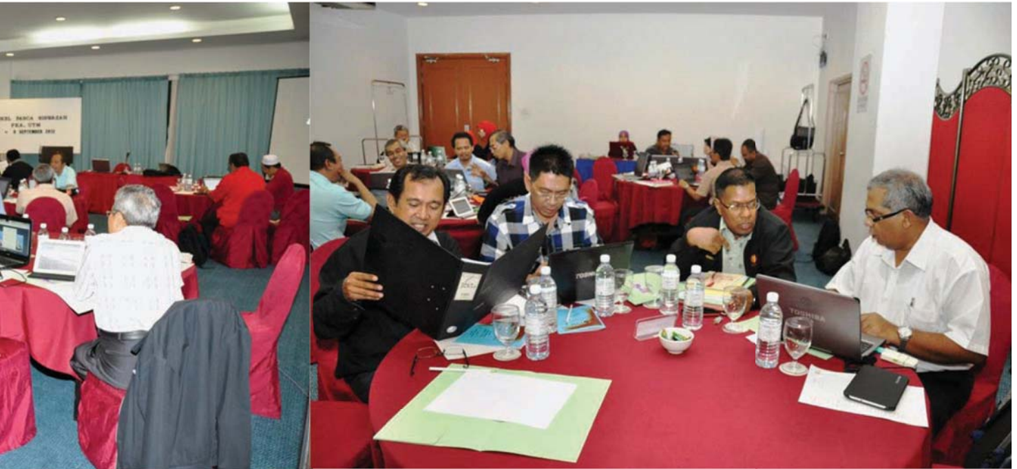
WORKSHOP ON EFFECTIVE IMPLEMENTATION OF STUDENT 14-15.8.2012