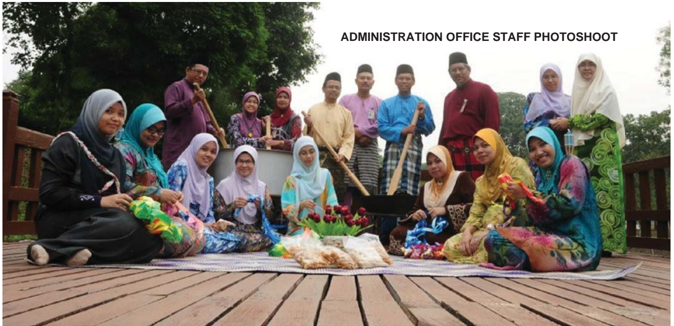
ADMINISTRATION OFFICE STAFF PHOTOSHOOT