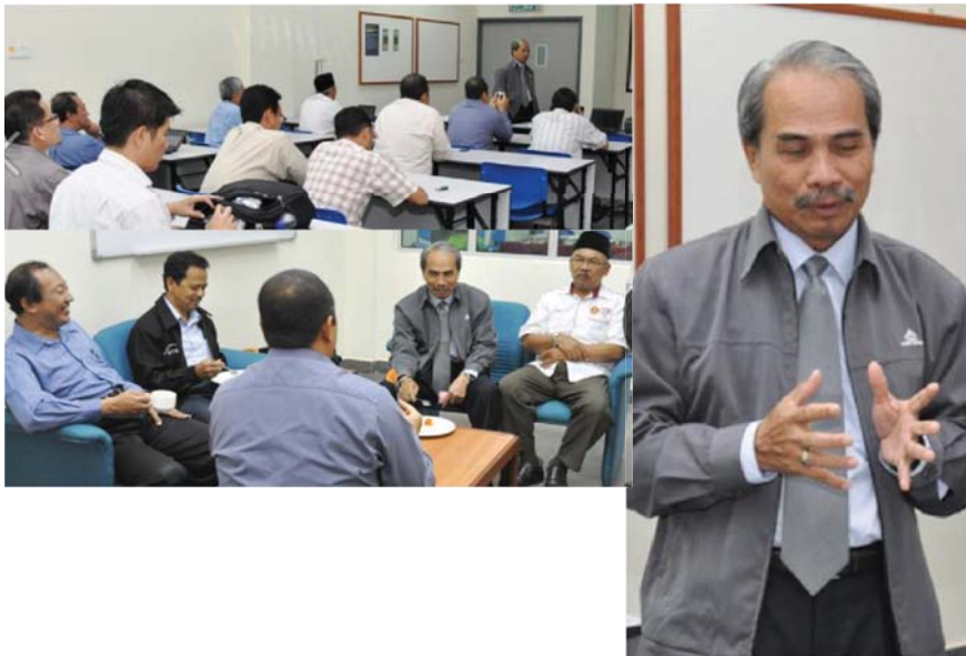
BLUE PRINT TOWARDS THE UTM NEW ACADEMIA WITH ACADEMIC STAFF