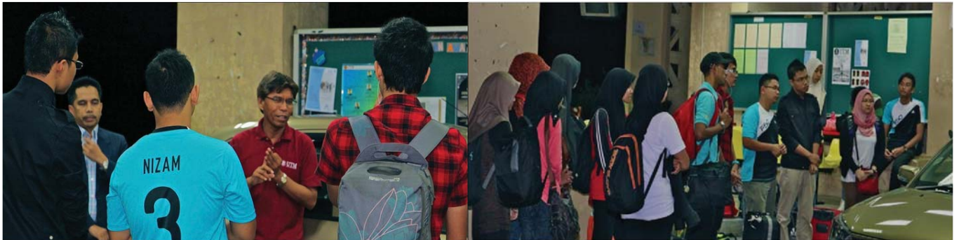
15 STUDENTS OF UTM-FKA TOGETHER WITH 25 ITS STUDENTS WERE INVOLVED IN THE 'SUMMER SCHOOL PROGRAMME' IN INSTITUT TEKNOLOGI SURABAYA (ITS), SURABAYA