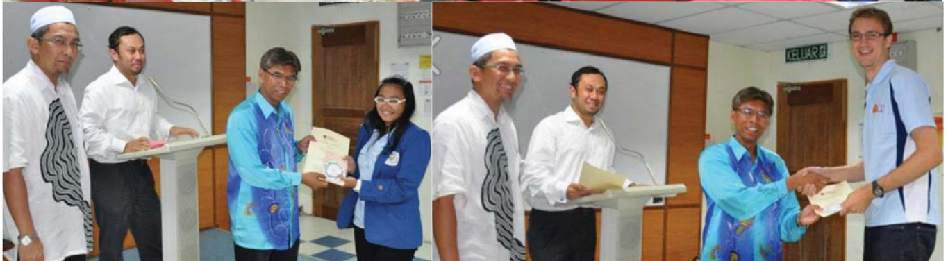
SUMMER SCHOOL MANAGING WATER ENVIRONMENT 2-19 JULY 2012