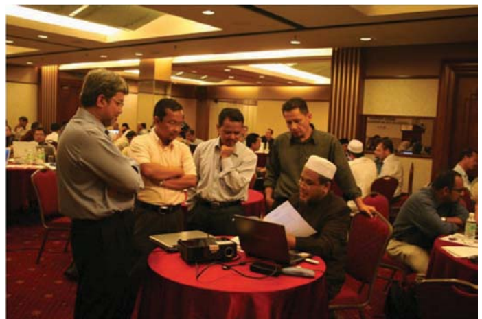
BENKEL PEMURNIAN PENYEDIAAN SOALAN PEPERIKSAAN AKHIR (25/4/2012)