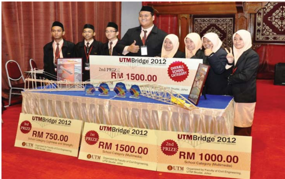
UTM BRIDGE COMPETITION 2012 MODEL COMPETITION, DESIGN, BUILT & TEST, 17-19 APRIL 2012