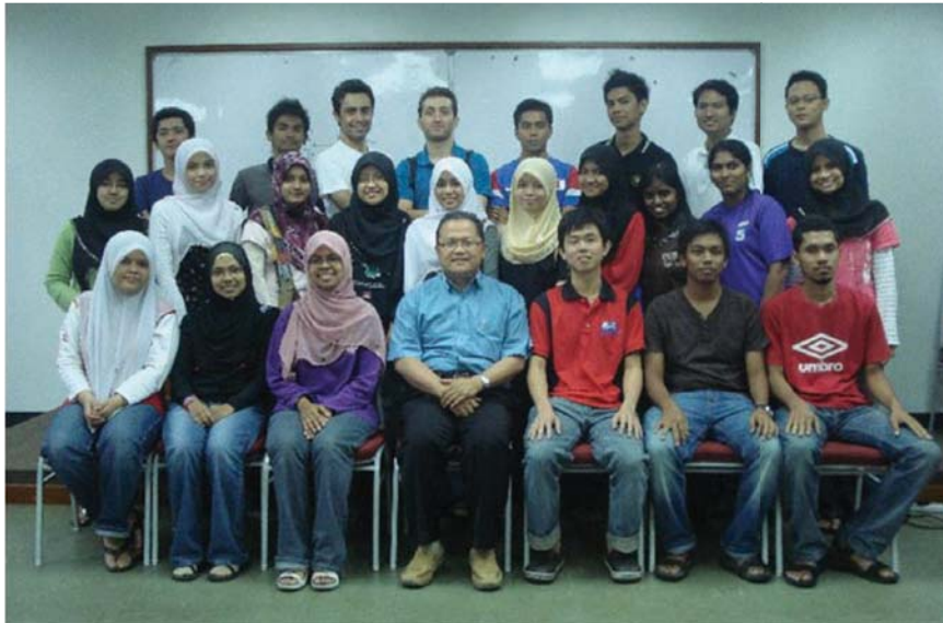
HSE4IP Training for UTM students, 19-20 Feb, 26-27 Feb, 5-6 March