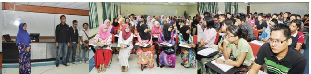
WORKSHOP ON PLANNING & SCHEDULING USING MICROSOFT PROJECT