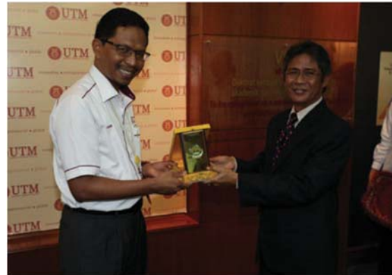
RA WATER AND IPASA WITH SAJ ON RESEARCH COLLABORATION