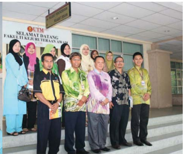
POLITEKNIK MERLIMAU VISIT, FEB 2012