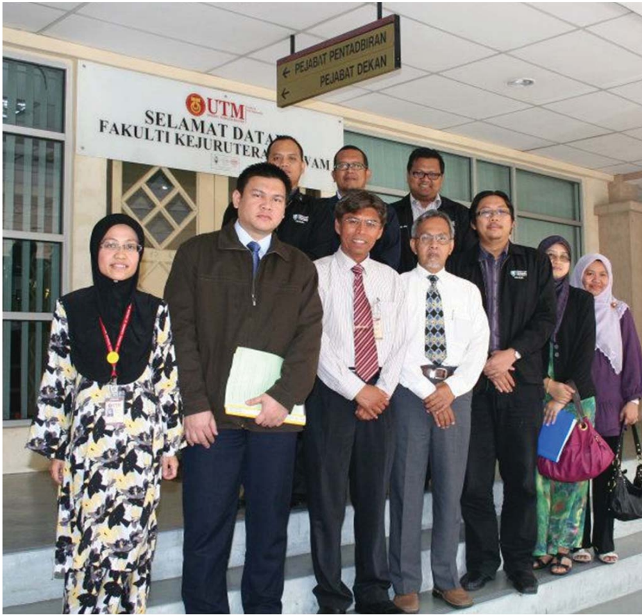
FKASA UMP VISIT, FEB 2012