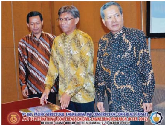
SIGNING CEREMONY BETWEEN UTM FKA AND ITS (INDONESIA) TO CONDUCT POSTGRADUATE MASTERS PROGRAMME

JOHOR BARU: SAJ Holdings Sdn Bhd is targeting to reduce its Non-Revenue Water (NRW) by 25% in 2020.