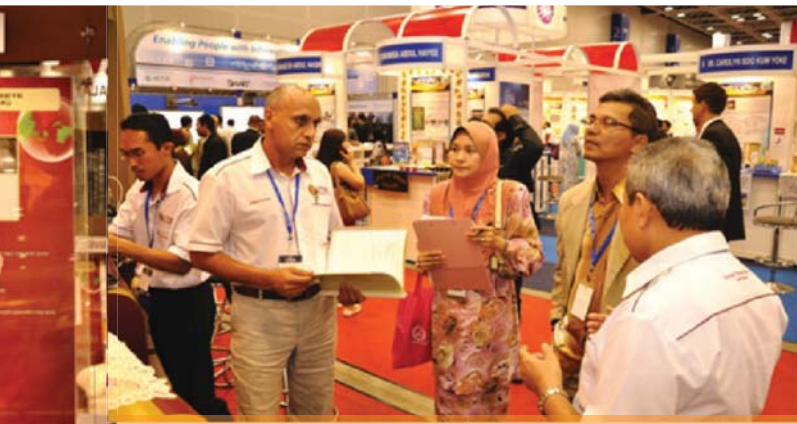
SILVER AWARD AT THE 23rd INTERNATIONAL INVENTION, INNOVATION & TECHNOLOGY EXHIBITION (ITEX), 17-19 MAY 2012, KLCC