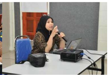
WORKSHOP ON APPLICATIONS OF STATISTICAL METHODS IN CIVIL ENGINEERING