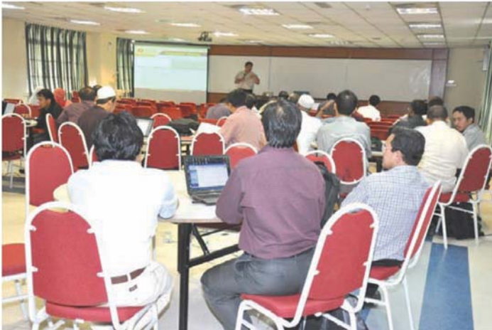
PRA-BENKEL PENYEDIAAN SOALAN PEPERIKSAAN AKHIR (10/4/2012)