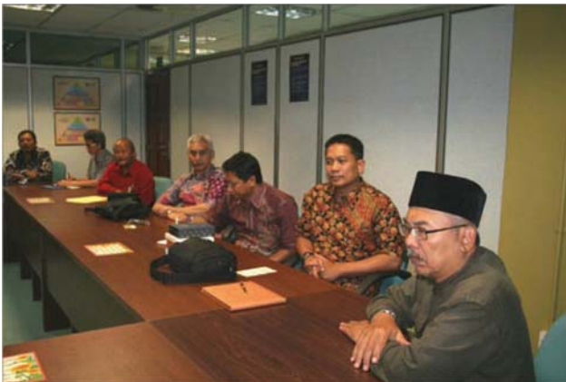
COLLABORATION BETWEEN FACULTY OF CIVIL ENGINEERING AND INSTITUT TEKNOLOGI SURABAYA (ITS) FOR APSEC 2012, SUMMER SCHOOL 2012, JOINT DEGREE PROGRAMME