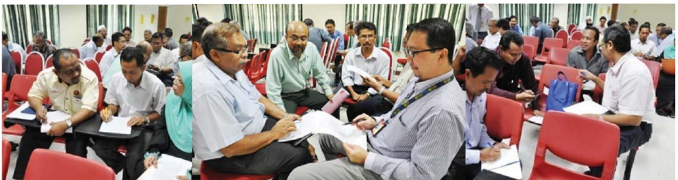
BENKEL PEMURNIAN PENYEDIAAN SOALAN PEPERIKSAAN AKHIR (25/4/2012)