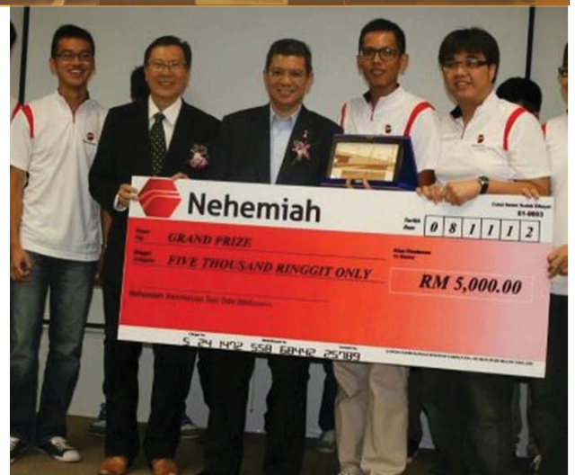
NEHEMIAH DESIGN COMPETITION 2012 1ST PRIZE RM5000 CASH AND A PLAQUE WINNER: 8 NOVEMBER 2012