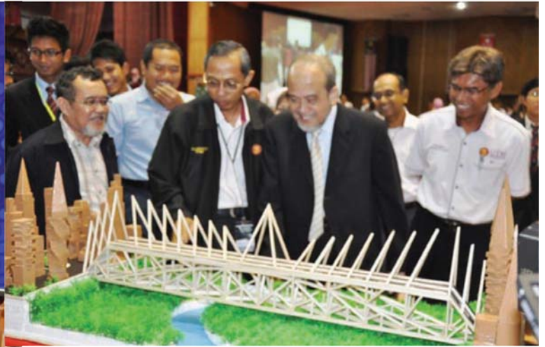
UTM BRIDGE COMPETITION 2012 MODEL COMPETITION, DESIGN, BUILT & TEST, 17-19 APRIL 2012