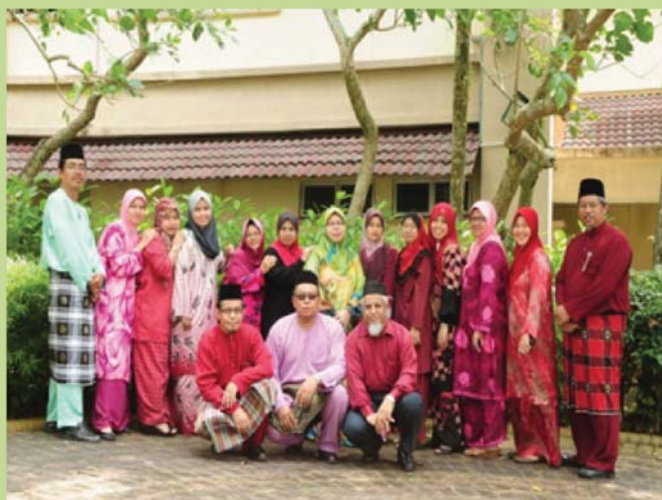
ACADEMIC OFFICE STAFF PHOTOSHOOT