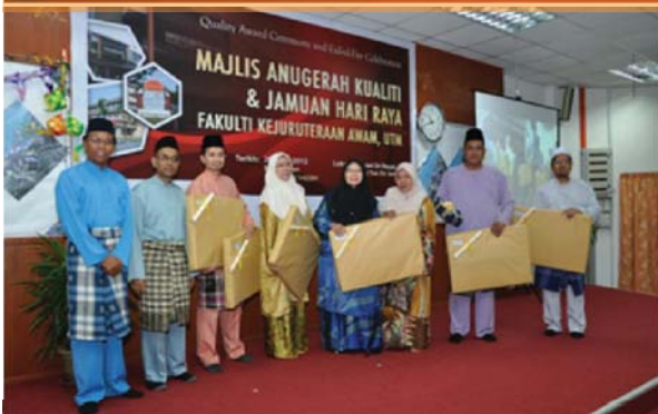
MAJLIS ANUGERAH KUALITI EVENT, 29 AUGUST 2012