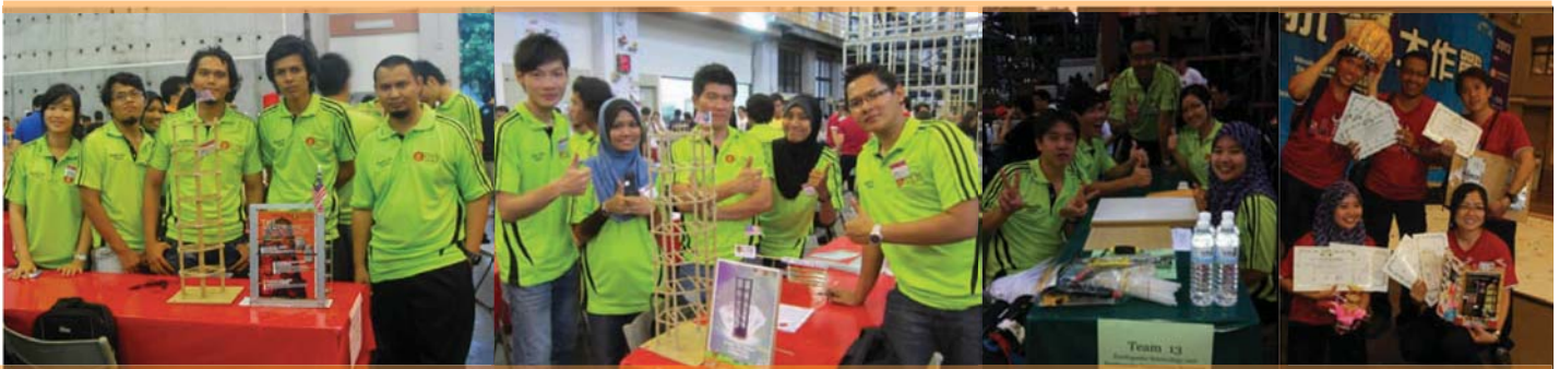
FACULTY OF CIVIL ENGINEERING BAGGED NINE AWARDS AT IDEERS – TAIWAN, 13 – 16 SEPTEMBER 2013