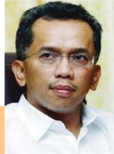
YB Dato' Seri Shaziman bin Abu Mansor

YB Dato' Seri Shaziman bin Abu Mansor is currently the Minister of Works, Malaysia since 2009, and was previously the Minister of Energy, Water and Communications. He holds a Bachelor of Science in Civil Engineering from Tri-State University, Indiana, USA and a Diploma in Civil Engineering from Universiti Teknologi Malaysia.