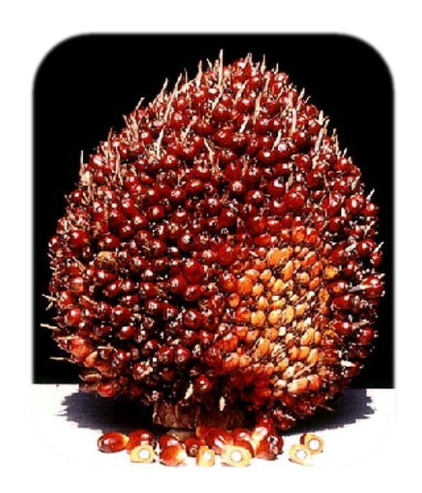
Figure 1.1 Palm oil fruit bunch