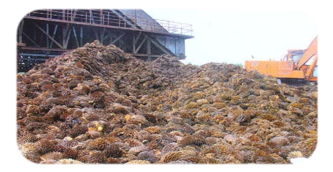
Figure 1.2 Empty fruit bunches in oil mill