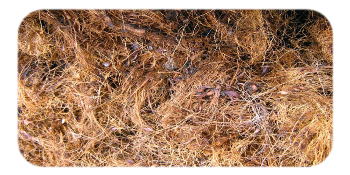
Figure 1.3 Palm oil fibre after extracting from empty fruit bunch