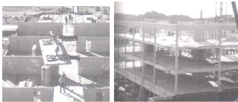
Figure 2.1: Precast Concrete Framing and Wall Systems