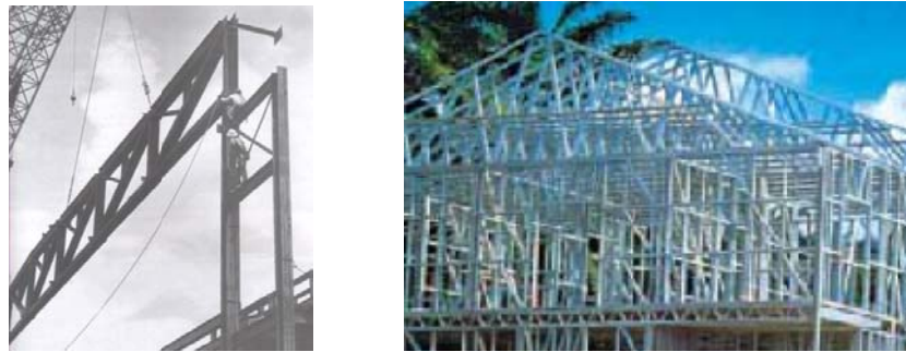
Figure 2.3: Steel Framing System and Roof Trusses