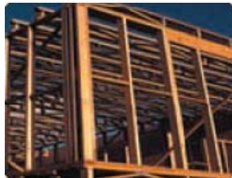
Figure 2.4: Prefabricated Timber Framing System