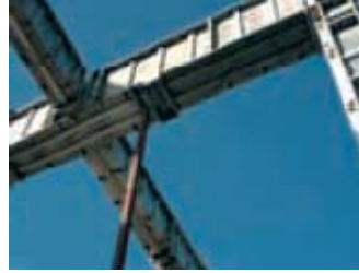
Figure 2.2: Steel Formwork System